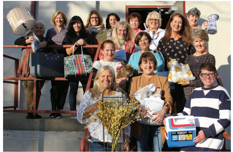
The Dennis Crafferty Memorial Auction Committee showcasing some of the great items featured.

Joseph’s Center has installed reliable emergency system generators in the 3 ICFs and most of the CLA homes. With these generators, we can ensure that in case of emergency, residents will still have the essential equipment they require around the clock. Some of the equipment residents are reliant on are feeding pumps, food processors, mechanical lifts, suction machines, nebulizers, high-frequency chest compression vests as well as typical household requirements such as refrigerators, garage doors and HVAC. The initiative took several years to complete, but with each power outage experienced it is well worth the effort and expense.