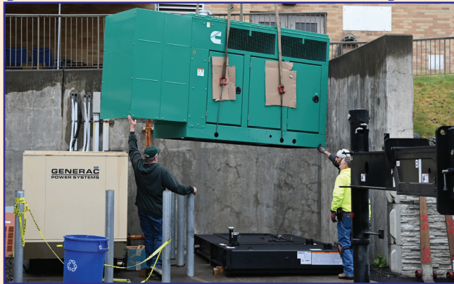
The brand new generator gets installed at the Main Center.

From its beginning, Saint Joseph’s Center has prioritized the health and well-being of those entrusted to their care. In a typical year, Saint Joseph’s Center provides residential services at the Intermediate Care Facilities (ICFs) for 99 persons with intellectual and developmental disabilities who have complex medical needs. Community Living Arrangements (CLA) serves an additional 45 individuals with intellectual disabilities in 13 community-based residential homes. One thing these programs have in common is a group of dedicated and caring staff, sharing the same goal of ensuring each resident has the potential to live their life to the fullest. With many of the residents being medically fragile, proper medical equipment is an essential part of their lives. With much of this equipment being electrically powered, Saint Joseph’s Center must always be able to keep them operating at full functionality. With grants from generous foundations and other fundraising, Saint